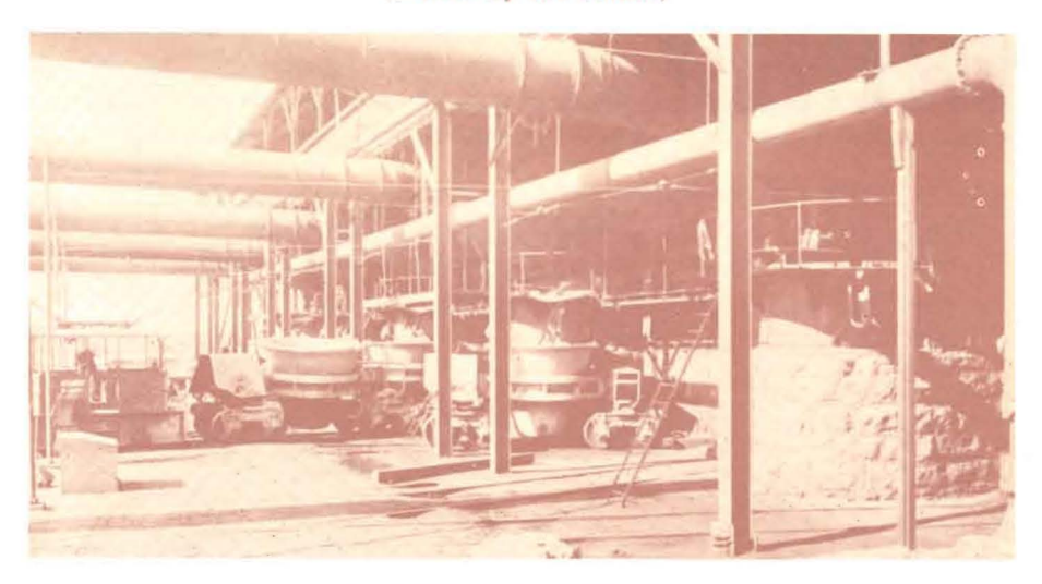
Fig. 1: From its inception, the economy of Douglas was geared to activity at the nearby copper smelters. Concentrated copper ore from the southwest and Mexico was smelted here, and then sent by rail to El Paso, where it was refined. Both smelters had an elaborate network of electrified railway trackage and were reached from the new city by the lines of the Douglas Street Railway.